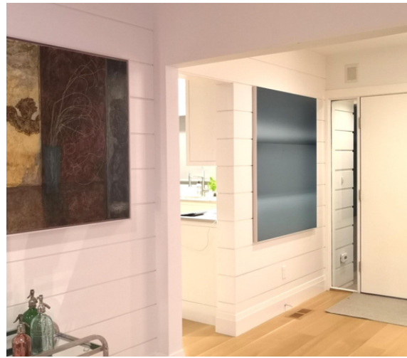
Artworks at private collectors homes in Germany and Connecticut