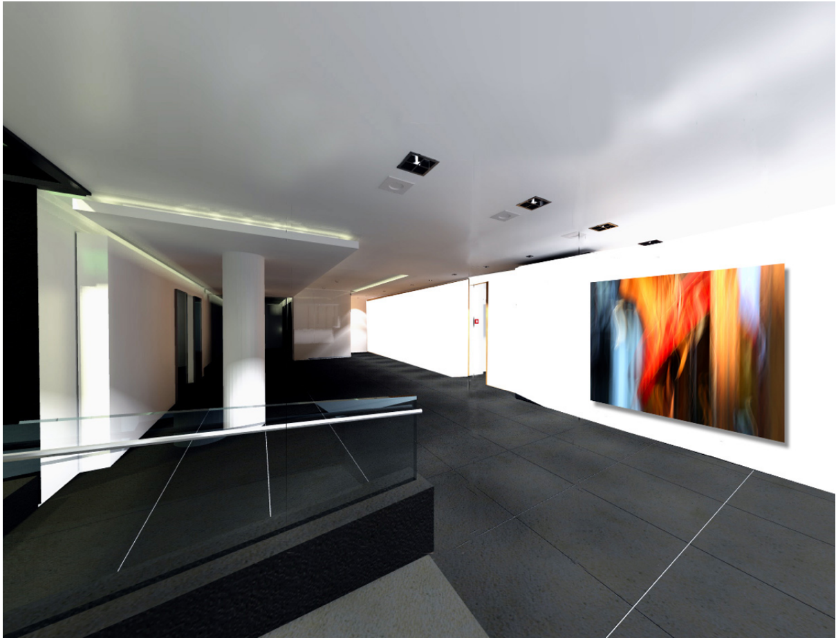
Jeffrey's commission in the Art Building in Brussels