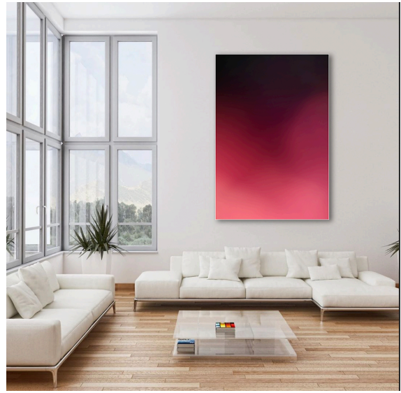
Above: Turquoise Tower, Lilac Tower#2, Lemon Drop, Beaten Heart from "the Language of Light" series (different sizes available, Limited edition of 5, C print, wooden art box frame plus Matt acrylic glass)

Elaine Jeffrey is a visual artist working in the medium of photography. Jeffrey