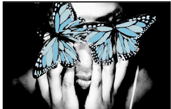
Top : the "butterfly series" at collector's homes.