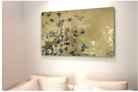
Above: Photos of Layla Love's art shown at collector's homes.